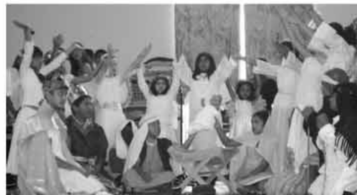
The Thornlie Parish Youth Choir entertained the guests